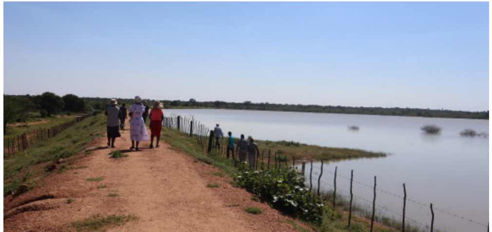
Midlo Dam in Ward 14 Emadwaleni, Matobo district, at full capacity after the 2020/21 rains

In December 2018, the Zimbabwe Resilience Building Fund (ZRBF) Sizimele project - in which DCA is the lead partner - came to the rescue of Matobo's, Ward 14, Emadwaleni community in Matobo, Mataberland, through the reconstruction of the 800,000m 3 Midlo dam, at a cost of US$60,000. Constructed in 1952, the dam provided water for domestic purposes, crop irrigation, and livestock. It was the only source of water for the 4326 individuals in the Ward, and supported the broader district population of almost 100, 000. In 2007, the dam breached after severe flash flooding resulting in dam failure. Between 2000 and 2009, more than 200 notable dam failures were recorded worldwide. Sudden, rapid, uncontrollable release of water which a dam cannot contain, is known as dam failure. Eventually, the community, in partnership with the Organisation of Rural Associations for Progress (ORAP), under a project funded by the United States Agency for International Development (USAID) attempted to repair the dam. But the embankment breached a second time in February 2017 on both sides of the central masonry spillway, which was constructed after the 2007 failure. It seemed all was lost for the people of Emadwaleni, until 2017, when the ZRBF Sizimele reconstruction project began. The absence of a dam meant that the residents