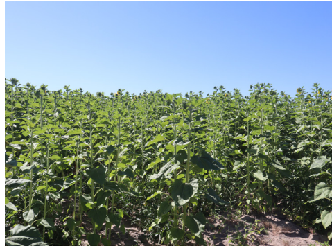
Sunflower crops in Lupane

The narrative of a bumper harvest has firmly gripped most spheres within and beyond Zimbabwe. In many circles it now serves as the premise to the eradication of poverty, propelled by significant economic growth. Among the adherents to this script is the World Bank which predicts economic growth of 2.9% attributed to an agricultural bumper harvest. Indeed, Zimbabwe is anticipating a maize harvest of over two (2) million tonnes. An increase in food production of 200% from the 2019/20 farming season. However, this argument assumes not only consistent maize yields across the country, but consistent income for most citizens. This is not the case. While Nyanga received 1200mm of rain, some areas in Matabeleland South received 700 mm, and places like Chiredzi and Mwenezi District grappled with a locust infestation, resulting in crop losses. In as much as varying rainfall patterns result in varied yields, COVID-19 magnified the poverty situation for the most vulnerable. In Zimbabwe, one-third more people were affected by food insecurity in 2021, than they were 2020. This according to Prime's World Relief and Development Fund (PWRDF), with whose support DanChurchAid provided emergency food aid to 3600 people in Lupane. This amounted to twice as many people confronting potentially life-threat-