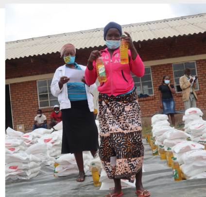
Beneficiaries collecting their emergency food allocation in Ward 18, Lupane in March