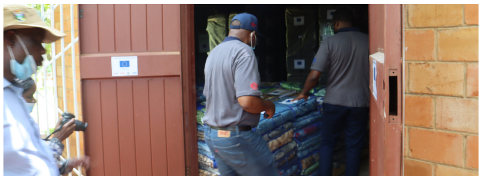
Honourable Minister Mavhima inspecting DCA's emergency response storage facilities in Bulawayo

communities in the southern lowveld found themselves having to contend with an outbreak of locusts. The locusts ravaged sorghum, millet and maize destroying nearly 8 000 hectares of the crops in Chiredzi and Mwenezi. Locusts were also detected in the Central, Eastern, and Southern regions of Zimbabwe — the worst infestation in decades. The outbreak left scores of farmers facing potential food insecurity. The Plant Protection Research Institute reported an outbreak of three indigenous locust species that damaged between three and 92% of small grains. Sorghum was the worst affected crop covering a greater part of the affected 7853,2 hectares of crop land in Chiredzi and Mwenezi. Other affected crops were pearl millet, beans, maize, sugarcane and cowpeas. Sugarcane damage was minimal at less than 5%. However, the outbreak exposed more than 4800 households to severe food insecurity in the two districts. The most affected areas were Chiredzi wards 1 – 12 and 22 where more than 2457 households had their crops damaged, while in Mwenezi some 2440 households in BJB, Chikokoto and Masungula. Such events, demonstrate the need for a fine scale nexus model approach to disaster management.