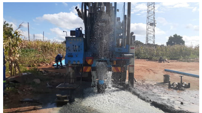
DCA drilled over 150 boreholes in Matebeleland North & South in 2020/21 to provide water to vulnerable communities