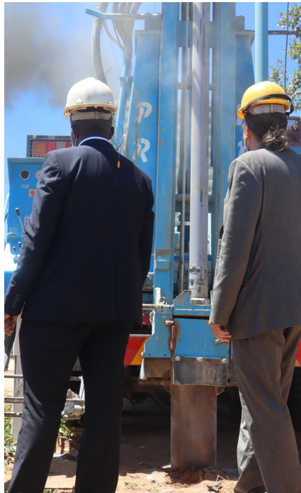
The groundbreaking event for the Bulawayo Water Emergency Project, held in March, in Emakhandeni with Bulawayo City Council