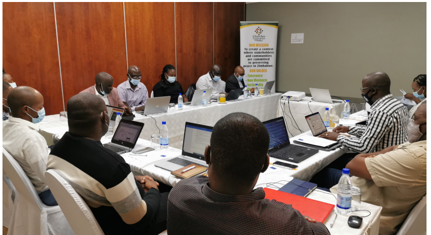
Churches Convergence on Peace consortium partners, held a quarterly stakeholder meeting in April