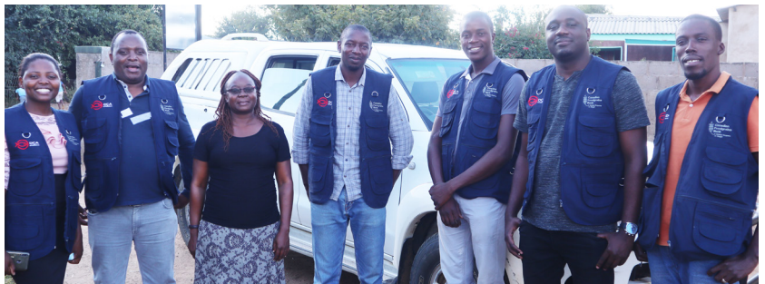
We said goodbye to project teams in Bulawayo, Harare and Lupane at the end of their respective projects in March and April 2021