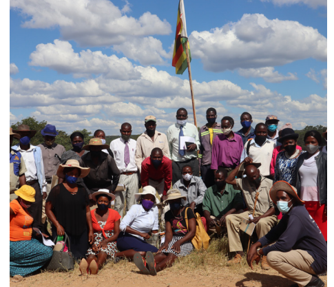
Participants at the Post-Harvest training workshop with Agritex in JibaJiba Village, Lupane