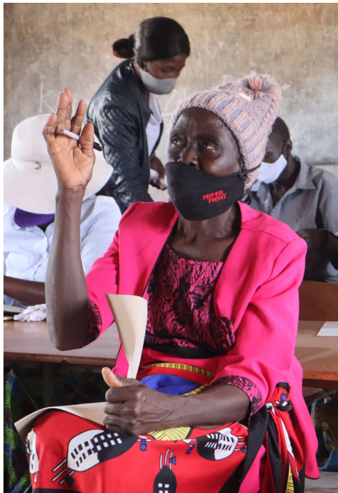
Community training sessions held in Jibajiba, Lupane in April, with the Ministry of Women's Affairs