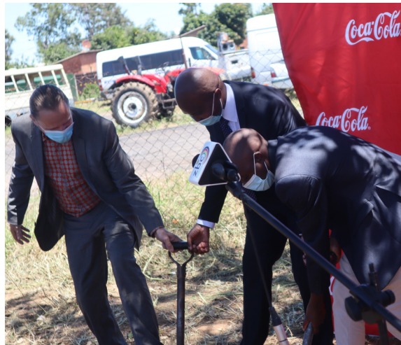
Project partners: Coca-Cola Zimbabwe, Bulawayo City Council and DanChurchAid, breaking ground in Emakhandeni in March 2021

DanChurchAid Zimbabwe with grant funding from the Coca Cola Foundation, partnered with Bulawayo City Council (BCC) to bring water to desperate residents in parts of the city. The project is a continuation of successful water sanitation and health (WASH) projects in the city, in partnership with BCC and Schweppes Zimbabwe Limited, since 2019. Bulawayo has long endured water risk, having experienced several climate change induced droughts because of, for example El Niño and La Niña climate patterns. In 2019, DCA successfully partnered with BCC to intervene when a diarrhoea outbreak struck the city, due to the consumption of contaminated water, in the absence of safe drinking water. In partnership with Schweppes, DCA provided support to 2,181 households in dire need of clean, safe drinking water in Bulawayo, through the establishment of community managed water kiosk, from the drilling of solar powered boreholes, equipped with storage tanks and taps, to ease the drawing of water. With the US$50,000 grant received from the Coca-Cola Foundation in February 2021, DCA has been able to build on efforts made towards providing sustainable water and sanitation solutions for low-income households, in high density suburbs in the city. The project delivered six solar powered boreholes to BCC, which were handed over by the three partners to