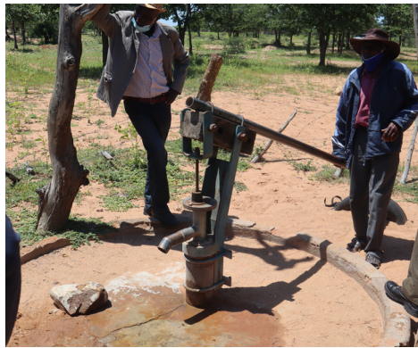
The one borehole in Tjehondo Village

after the rains. The borehole is the single source of water for the village people and their livestock. The source of irrigation for their crops is Makhasa dam which is situated in Makhasa Village, 10 km away. The distance makes it difficult for the 71 farmers participating in an irrigation project in the village. A local fishpond which used to be a source of food and income, is non-functional because of the lack of access to water. To assist the village, Bitz has designed a bespoke series of glasses, titled "Kusintha", meaning to win, in Swahili. Profits from these glasses will be channelled to the village and assist in the drilling of a new borehole for the village. This will assist villagers to grow and irrigate their crops, and from the in-