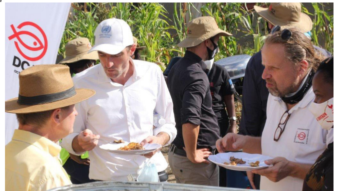
DCA hosted donors from the European Union delegation in Zimbabwe, the Denmark Ministry of Foreign Affairs, and WFP between February & March