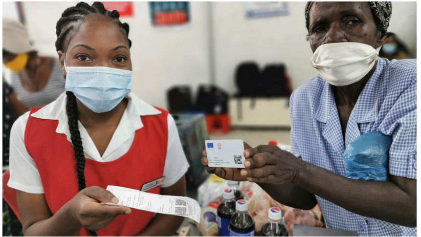
Beneficiaries of the Urban Social Assistance Programme received entitlements in February & March